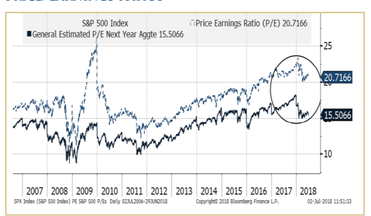
FIGURE ONE: S&P 500 INDEX TRAILING AND FORWARD PRICE/EARNINGS RATIOS

U.S. firms' earnings' growth, solid real estate markets, and record-low unemployment are constructive to the investment landscape. S&P 500 Index companies earnings rose over 23% year over year in 2018's first quarter. Some investors seemed wary that earnings growth this late into an expansion cycle cannot last. They may yet be surprised as lower tax rates underpin near term strength. S&P 500 Index valuations are reasonable as estimated price to earnings (P/E) twelve months out are below 16 times. Forward earnings multiples relative to trailing P/E have widened as shown in Figure One.